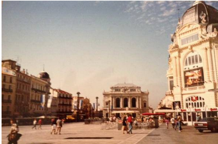
Place de la Comédie with cinema on the right.

The original version had taken place in an unspecified town in Vichy France. This time around, I decided to be specific, choosing Montpellier, a city I knew well from walking almost every street and alleyway. Most importantly, its prestigious university has always attracted international students which gave me a suitable place for Kurt to study, while the surrounding countryside with its perfumed hills and picturesque vineyards provided an idyllic setting for Camille's home.